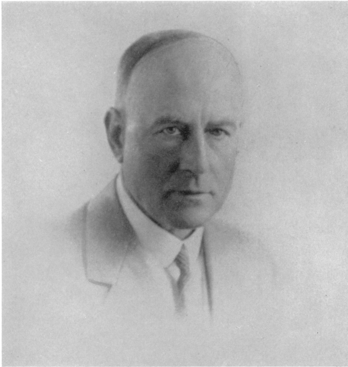
FREDERICK GRIFFITH, 1879-1941

The main part of this issue is published as a memorial to Frederick Griffith. To commemorate the twenty-fifth anniversary of his death we are reprinting one of his most important papers on 'The Significance of Pneumococcal Types' ( J. Hyg. Camb. (1928), 27 , 113-59). This is followed by contributions by some of his friends.